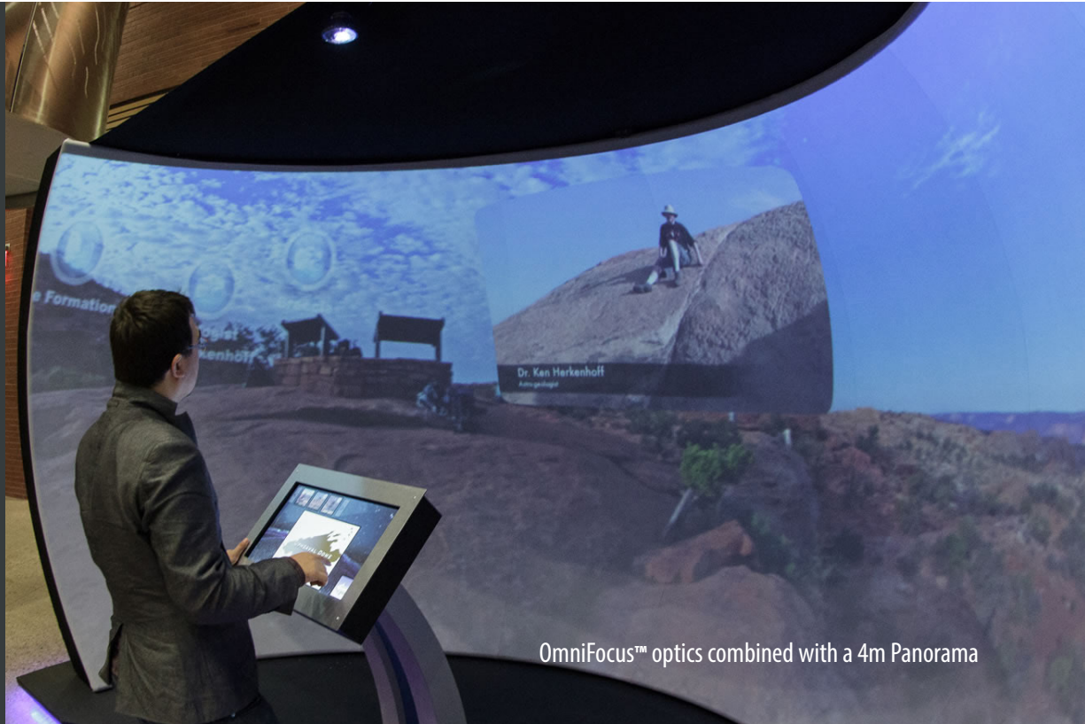
OmniFocus™ optics combined with a 4m Panorama